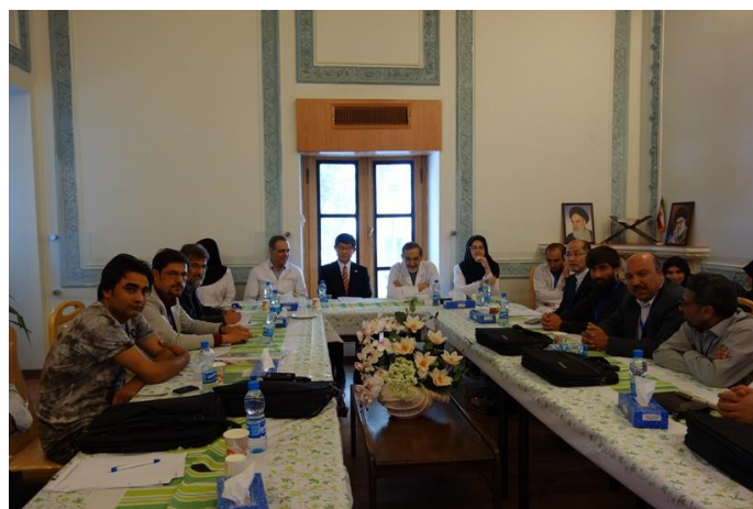
H.E. Dr. Velayati delivering a lecture