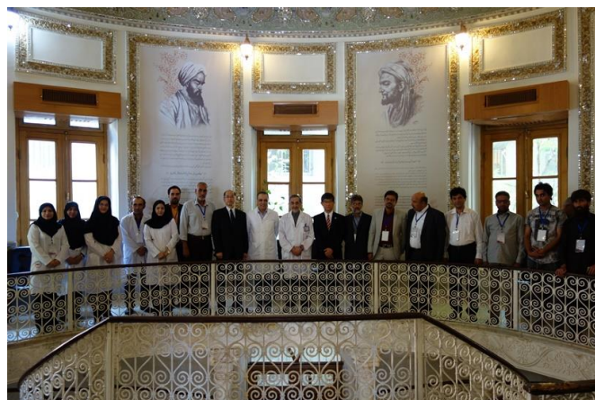
All trainees and participants